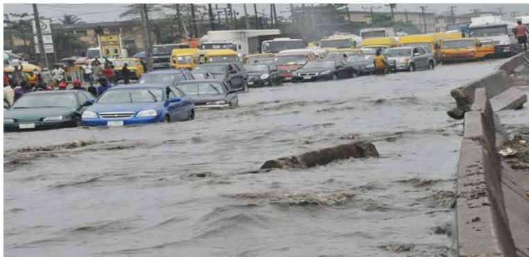
PLATE 2: Pictures of Flooded road and traffic built-up

Another reason for flood occurrence is the absence of drainage system. As much as possible landlords must make provision for proper drainage system that will take care of not only the waste water in the house but also the surface run-off emanating from torrential rainfall.