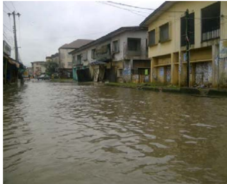
PLATE 1: Flood has taken over this street and evidences of no vehicular movements are obvious

Another major factor influencing flood occurrence in cities is drainage failure. It is very common to find drainage system that are no longer functioning or had failed without attention being paid to it. In such circumstances, the flooded water makes use of the traffic corridor instead of the drainage and this affect free flow of traffic in urban environment as shown in Plate 2.